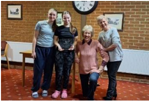
Ladies League Champions